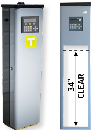
Part # SB PEDESTAL ASSY-5 Part # SB PEDESTAL ASSY-2