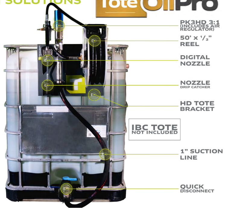
**Package includes all items listed above. TOTE OilPRO bracket not sold separately.