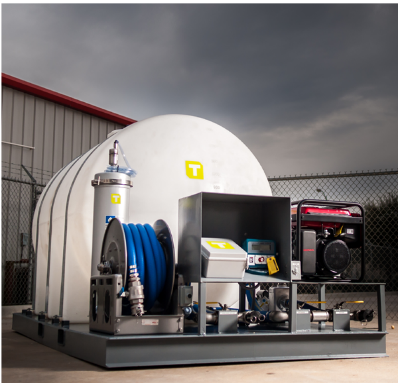
PRO-6000 MOBILE DEF TRANSFER PUMP SYSTEM