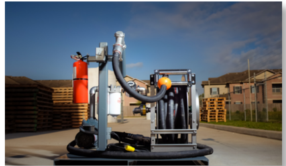
PRO-6000 BULK OIL TRANSFER SYSTEM

Whatever your flow may be, let us know. Let us see how we can help you design a tailor-made solution to meet whatever challenges are in your way.