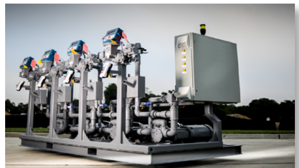
PRO-6000 MOBILE OIL TRANSFER CART